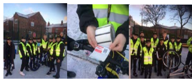
Bike marking task completed before school... mini police supporting our local community