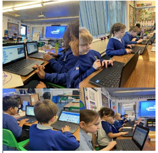
Year 3 have really enjoyed learning about programming, using Scratch in their computing lessons