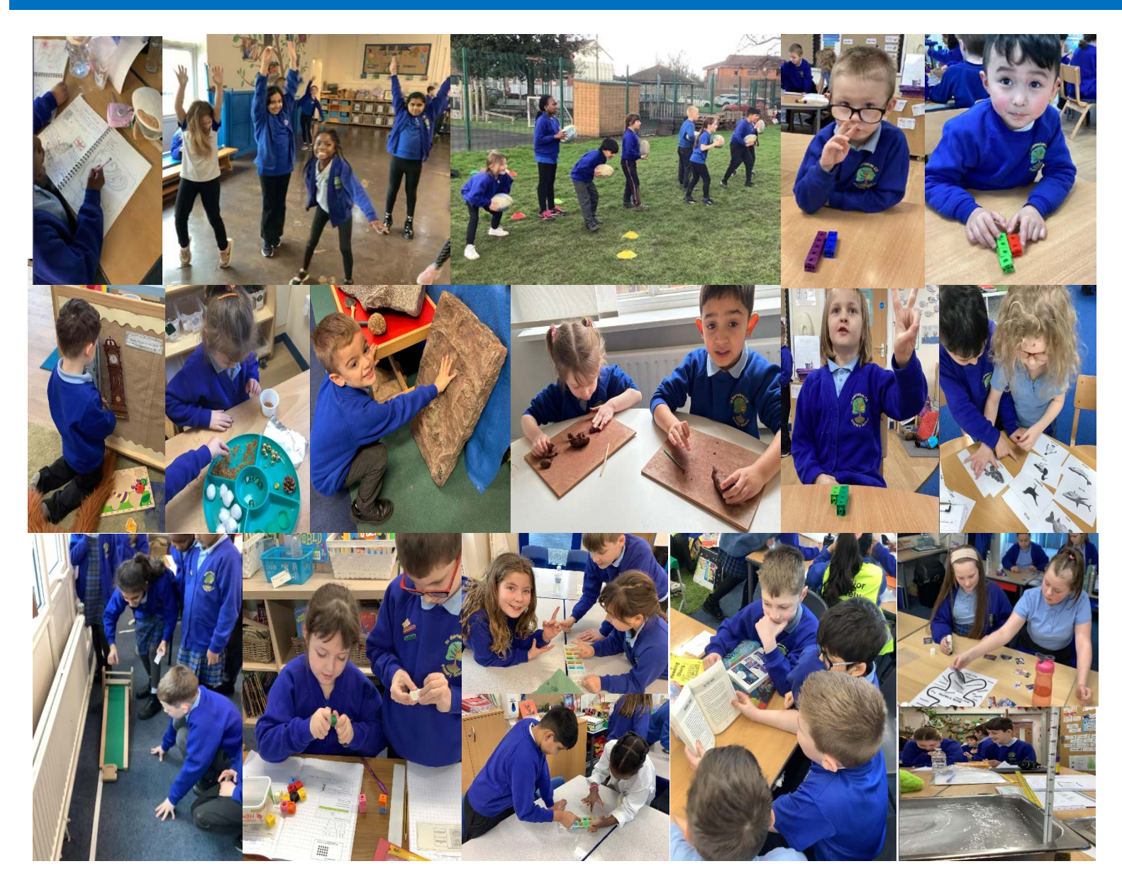
HERE ARE SOME OF THE WAYS OUR AMAZING CHILDREN HAVE 'LET THEIR LIGHT SHINE' THIS WEEK IN SCHOOL ...

The children may not see approaching cars and approaching motorists may not see the children. Please do not stop in the middle of the road to let out your children. Thank you for your support.