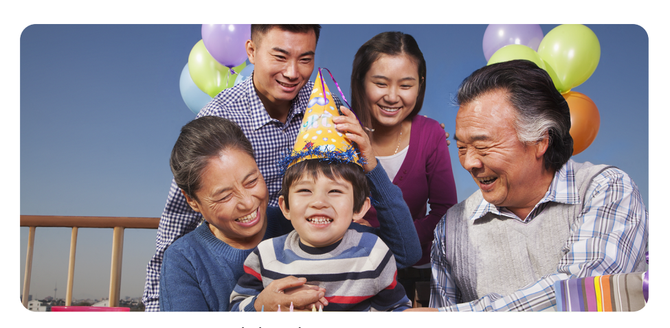
Birthdays happen every year.

Important life events include birthdays, religious festivals or family celebrations. Some life events happen every year and some happen at certain stages of human life.