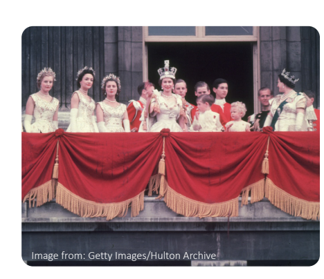
Queen Elizabeth II on her coronation.

A coronation is a ceremony where the crown is placed on the head of the new king or queen. Elizabeth II is the Queen of the United Kingdom. The coronation of Elizabeth II took place on 2nd June 1953 at Westminster Abbey, London. Many people celebrated the coronation by holding street parties.