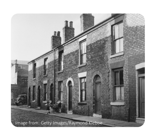
A street in the 1950s.

The way people use land changes over time. For example, in the 1950s there were fewer cars, so fewer roads were needed. Today lots of people have cars, so there are many more roads for people to drive on and driveways for parking.