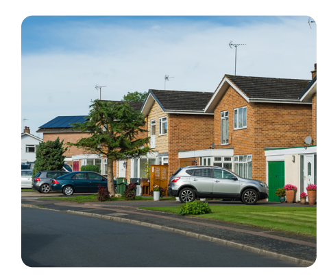
A street today.