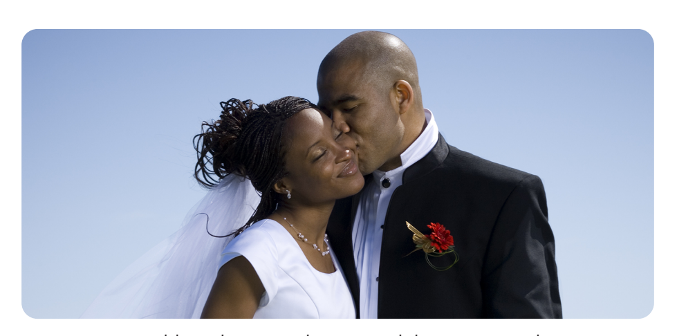
Weddings happen when two adults get married.