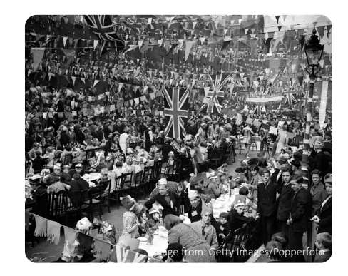
Street party to celebrate the coronation.