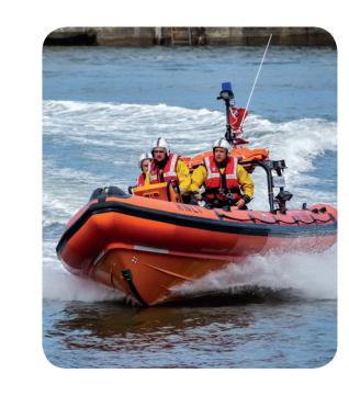
Call 999 in an emergency. Ask for the coastguard and they will call for the lifeboat.