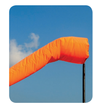
Do not use inflatable toys or airbeds in the sea when a wind sock is blowing.