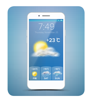
Check the weather forecast for bad weather.