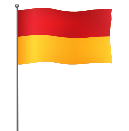
Red and yellow flags mean it is safe to swim.