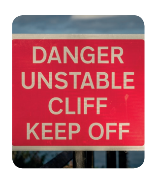
Look for warning signs, follow advice and do not take risks.

The coastline can be a dangerous place. It is important to stay safe and know what to do in an emergency.