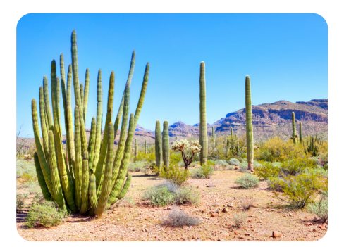
Cacti grow in desert habitats.

Plants are living things that change with the seasons. They grow in different habitats.