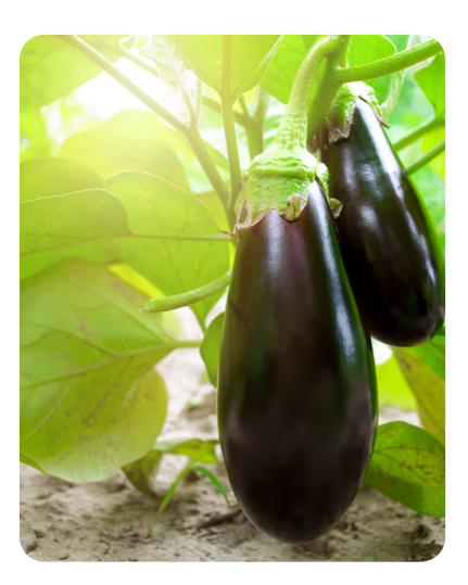
healthy aubergine plant

Plants need space to grow. If an area is overcrowded, the nutrients and water in the soil are used up. Overcrowding also blocks sunlight.