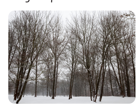
deciduous trees in winter

Trees can be deciduous or evergreen. Deciduous trees lose their leaves in autumn and have bare branches in winter. Evergreen trees shed old leaves and grow new leaves all year round, which means they keep their leaves in winter.