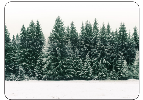
evergreen trees in winter