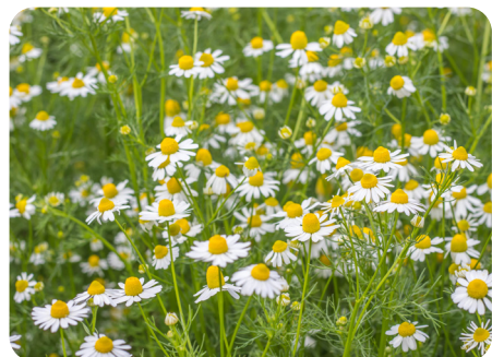
Daisies grow in meadow habitats.