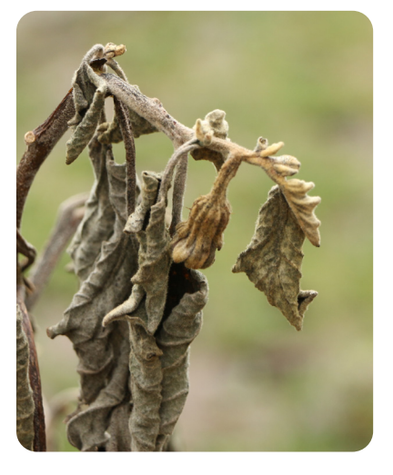
unhealthy aubergine plant