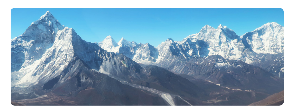
Himalayas mountain range

A mountain is a large, raised part of the Earth's surface. A mountain's highest point is called its peak or summit. Mountains are at least 610m in height. A mountain range is a chain of mountains that are close together. They are usually arranged in a line connected by ridges.